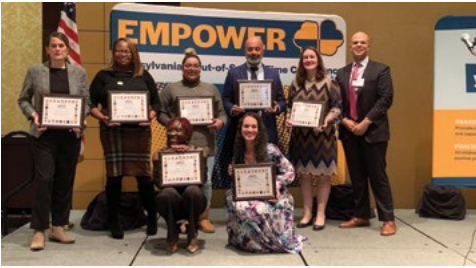
Meet the winners on PSAYDN.org